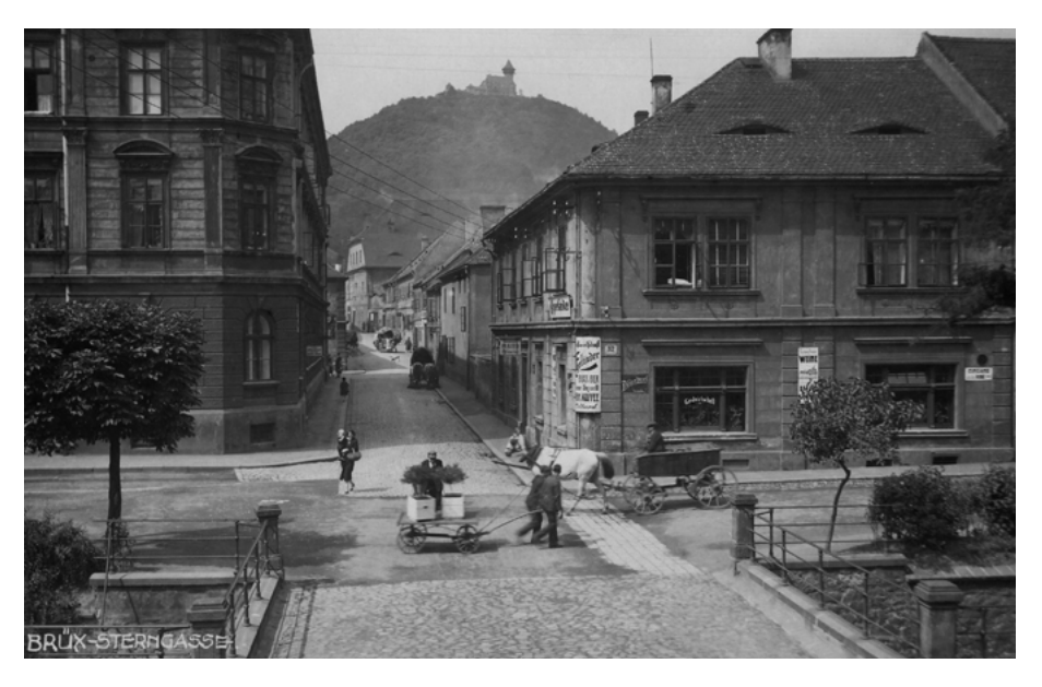
The town of Most in the troubled times of social protests as a still mainly German town. Sterngasse in the 1930s.

of it, unlike religious affiliation. The history of Most was, however, clearly shaped both by people whose mother tongue was Czech and by people whose mother tongue was German. As a royal borough, Most was not founded in connection with the German settlement of the borderlands of Bohemia. But, beginning in the fifteenth century at the latest, the German language was making itself felt both in official records and amongst the population thanks to the influence of Saxony and, eventually, also the Lutheran Reformation. In the eighteenth century and the first half of the nineteenth, Most was linguistically a German town. Czech influence began to increase only in connection with the development of coal mining, when workers were recruited from more distant regions. This trend initially tended to change the ethnic structure of the countryside; the town itself remained mainly German (even in the 1880 census, ninety per cent