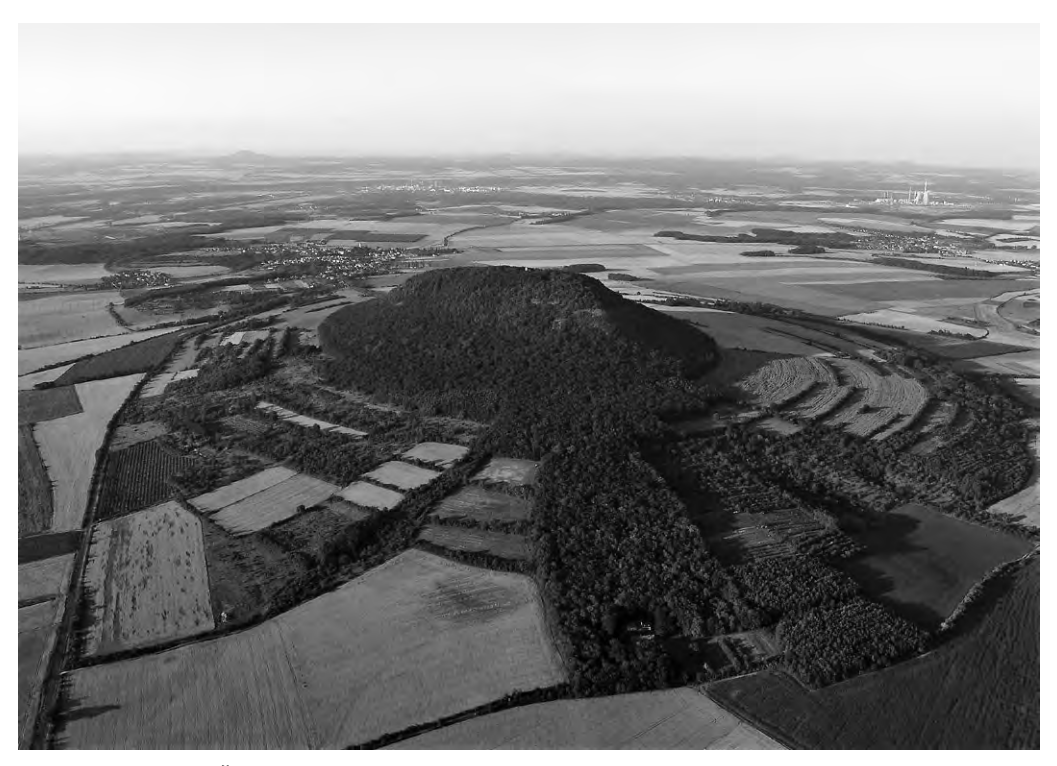
An aerial view of the Říp Mountain from a distance

and this lack of natural routes into the country was only compensated when artificial ones were carved out later."